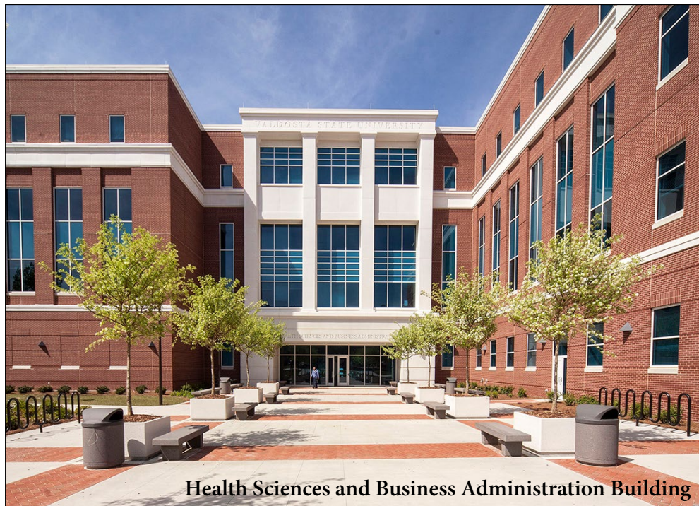
Health Sciences and Business Administration Building