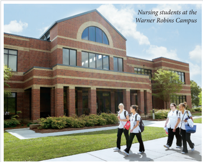
Nursing students at the Warner Robins Campus

MGA's 182-acre historic Cochran Campus in Bleckley County has a traditional quad, stately oaks, and a scenic lake. With MGA's largest concentration of student housing, the University's intercollegiate athletic program is based here, which includes men's baseball, basketball, soccer, and tennis; and women's basketball, cross country, soccer, softball, tennis and volleyball.