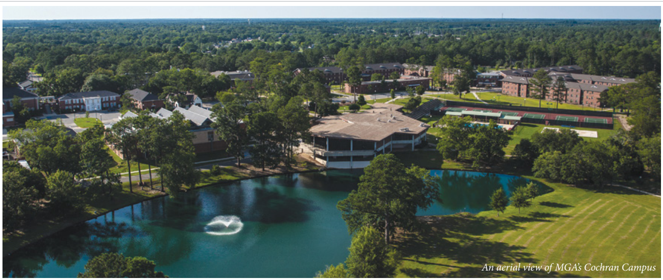
An aerial view of MGA's Cochran Campus