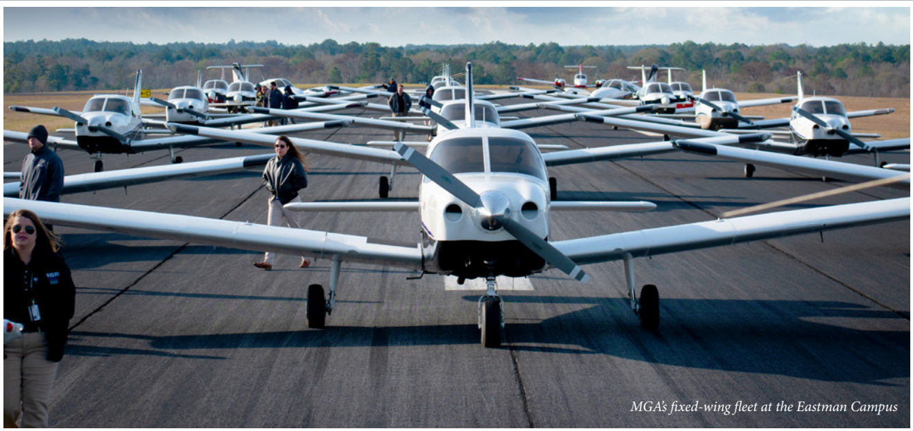
MGA's fixed-wing fleet at the Eastman Campus

The fifth MGA campus is located in Warner Robins . This 72-acre campus is just a half mile from the main gate of Robins Air Force Base in Houston County. The campus instruction supports bachelor's degrees in Nursing, IT, Business, and Early Childhood Education.