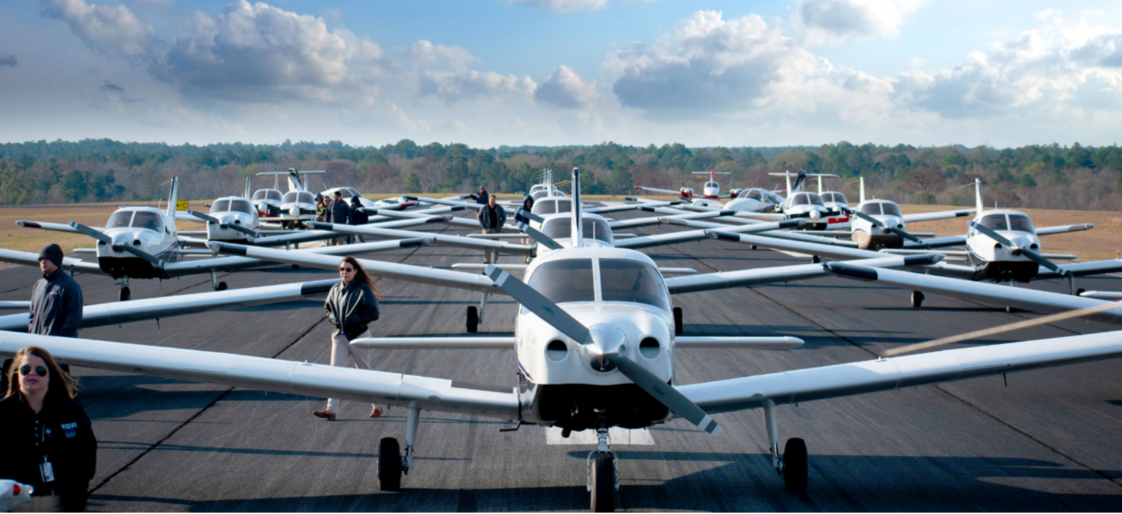
MGA's fixed-wing fleet at the Eastman Campus