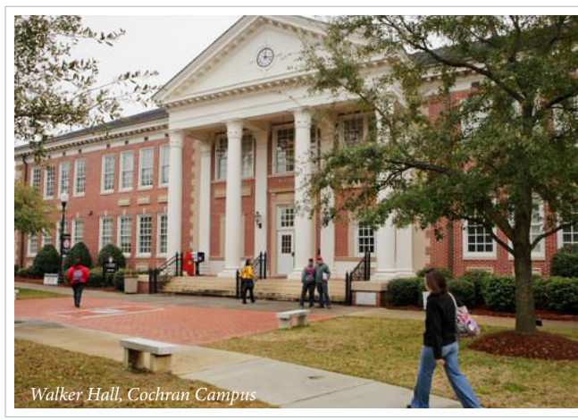
Walker Hall, Cochran Campus