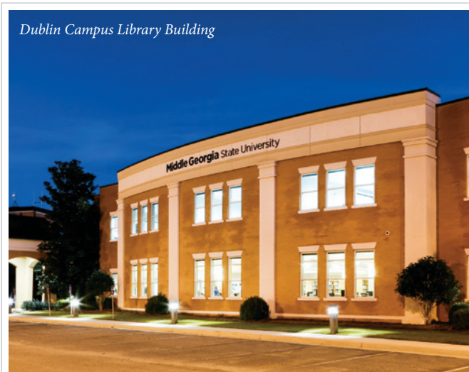
Dublin Campus Library Building