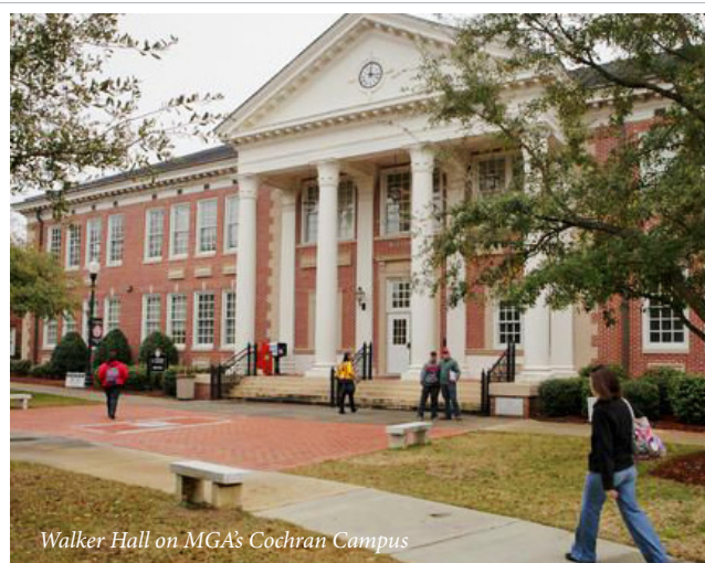
Walker Hall on MGA's Cochran Campus