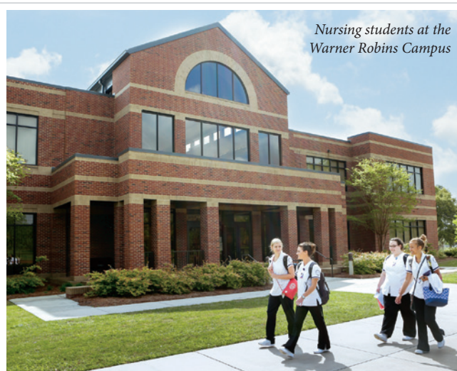
Nursing students at the Warner Robins Campus

MGA's 182-acre historic Cochran Campus in Bleckley County has a traditional quad, stately oaks, and a scenic lake. With MGA's largest concentration of student housing, the University's intercollegiate athletic program is based here. The campus also is home to the Georgia Academy for Math, Engineering, and Sciences, a program for highly motivated high school students.