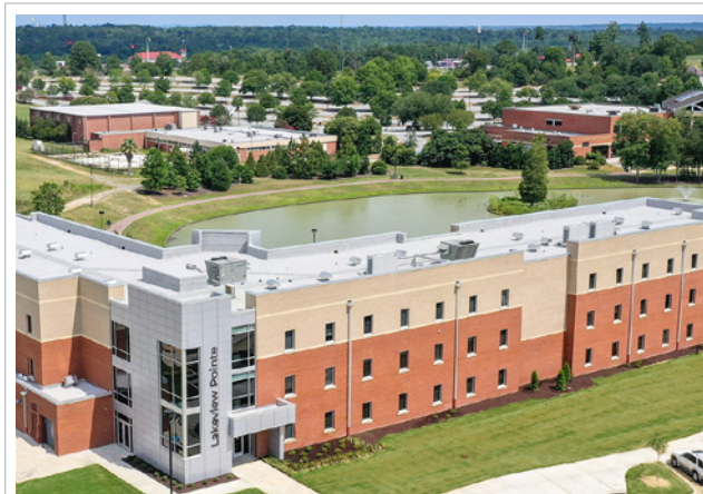
Lakeview Pointe student housing on MGA's Macon Campus