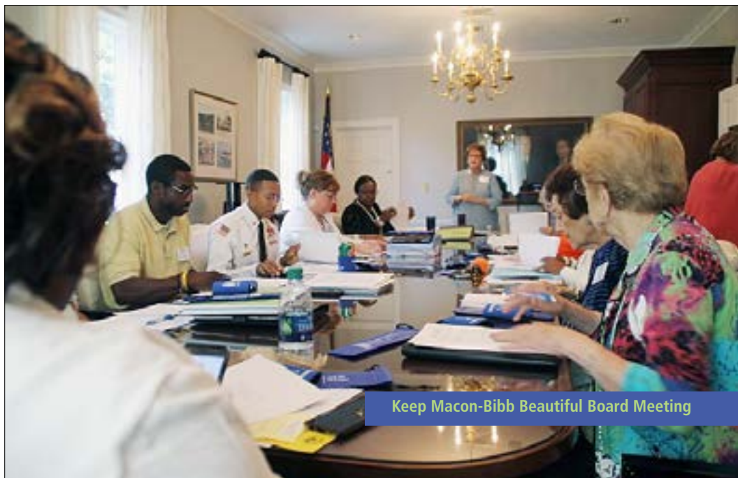
Keep Macon-Bibb Beautiful Board Meeting