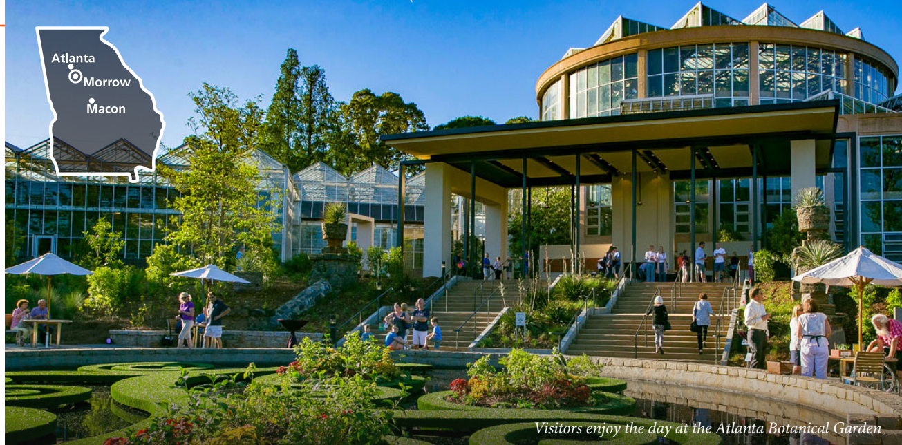
Visitors enjoy the day at the Atlanta Botanical Garden