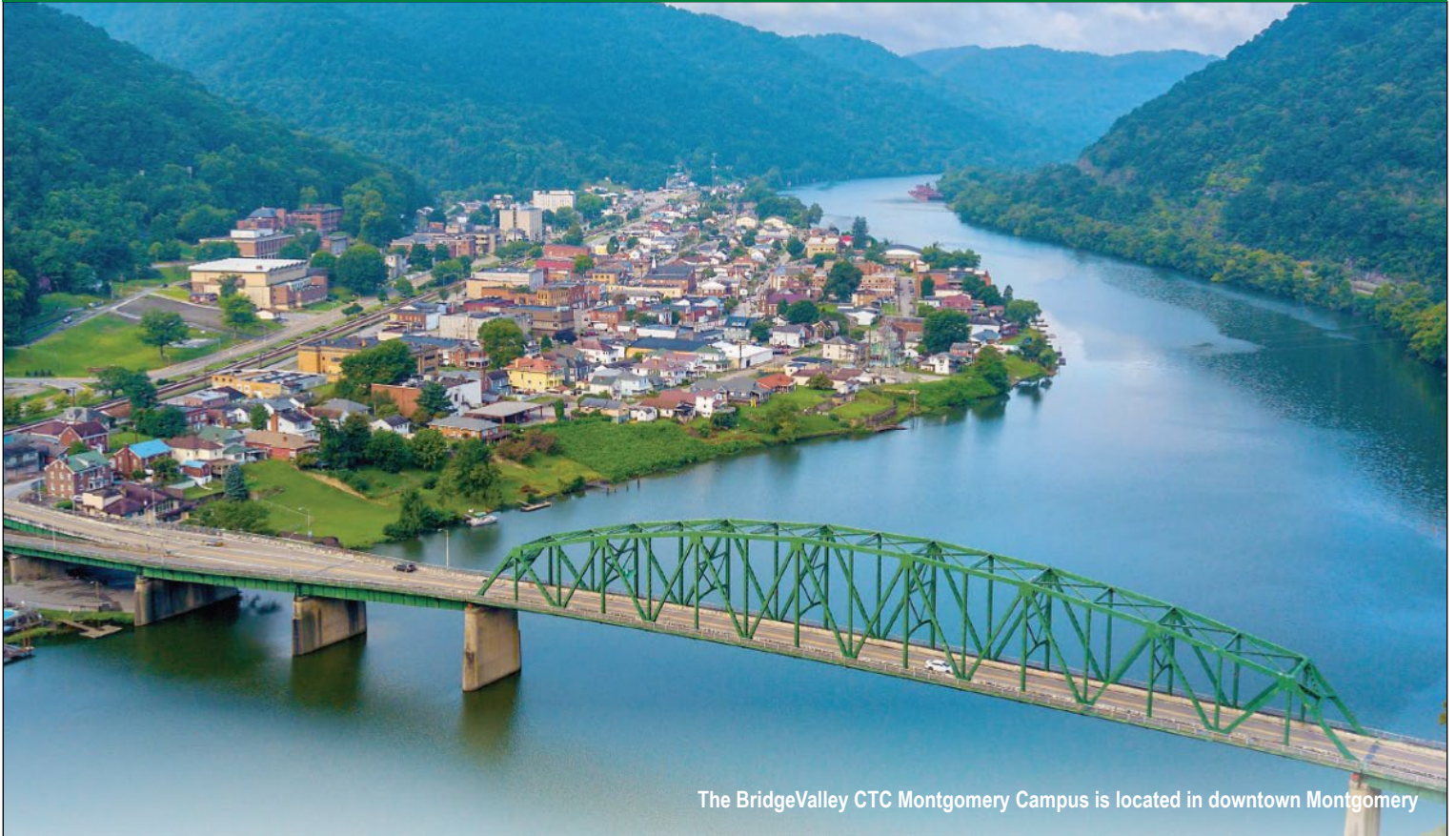
The BridgeValley CTC Montgomery Campus is located in downtown Montgomery