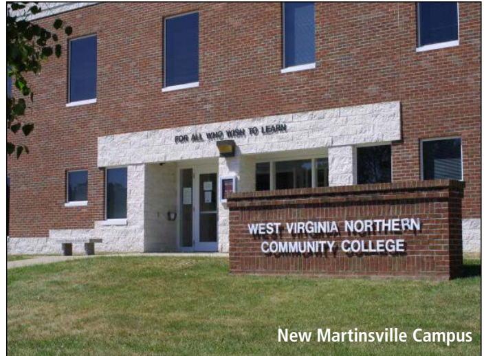
New Martinsville Campus

If seeking a more urban outing, Wheeling is less than an hour from the Pittsburgh International Airport and two hours from Columbus, OH.