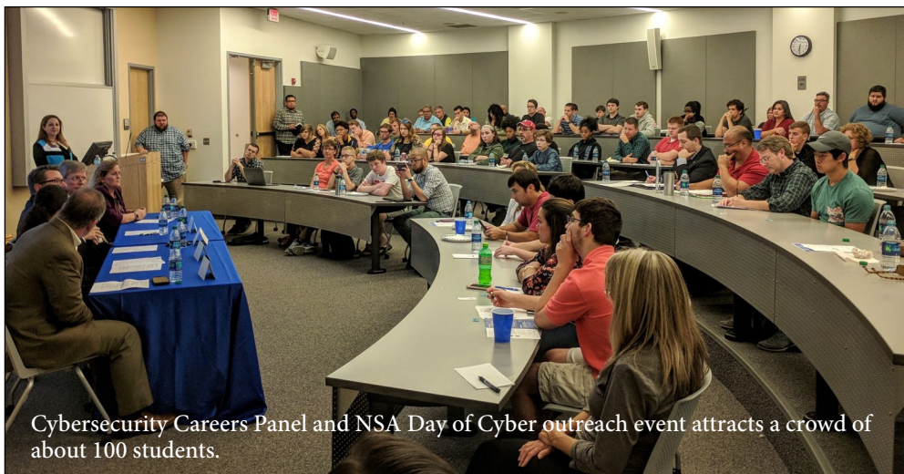
Cybersecurity Careers Panel and NSA Day of Cyber outreach event attracts a crowd of about 100 students.

Known as the "Cradle of Naval Aviation," Pensacola is home to the first U.S. Naval Air Station, established in 1914, and the National Naval Aviation Museum.