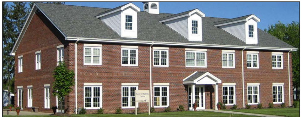
The Seifert-Mooney Center for the Advancement of Clarion University houses the offices of Advancement, Alumni Relations, Clarion University Alumni Association and Clarion University Foundation, Inc.

Capital of the World," Clarion is regarded as one of the top outdoor recreational areas in Pennsylvania. With a backdrop of rolling wooded hills, the Clarion community offers canoeing, horseback riding, and camping. For those who love winter activities, 12 miles of snowmobile