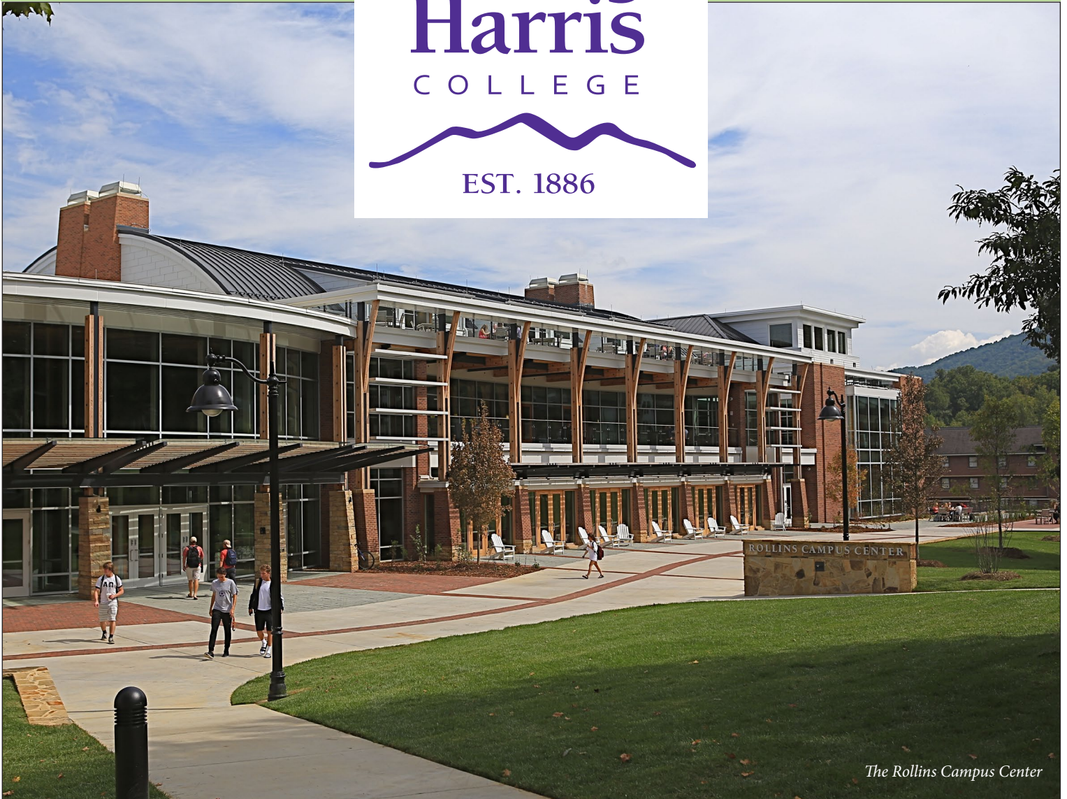
The Rollins Campus Center