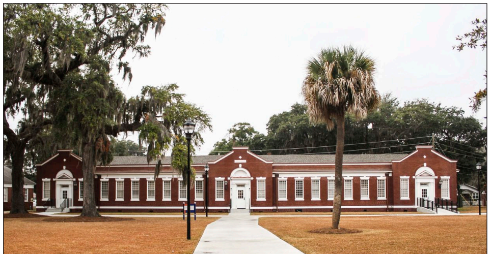
Morgan Hall houses the School of Teacher Education on the Savannah State campus.

Savannah State's 4,900 students are provided a supportive yet challenging learning environment with opportunities