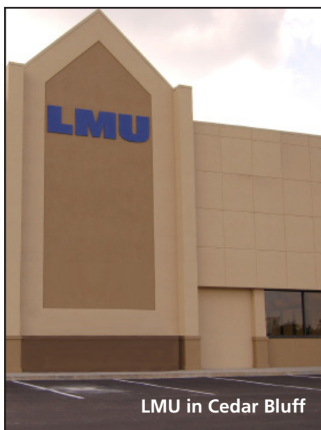
LMU in Cedar Bluff

The mission of the School of Business is to prepare leaders who are able to meet and exceed the challenges of today’s integrated world economy, and who can balance ethics and social responsibility with the creation of profits and wealth for the betterment