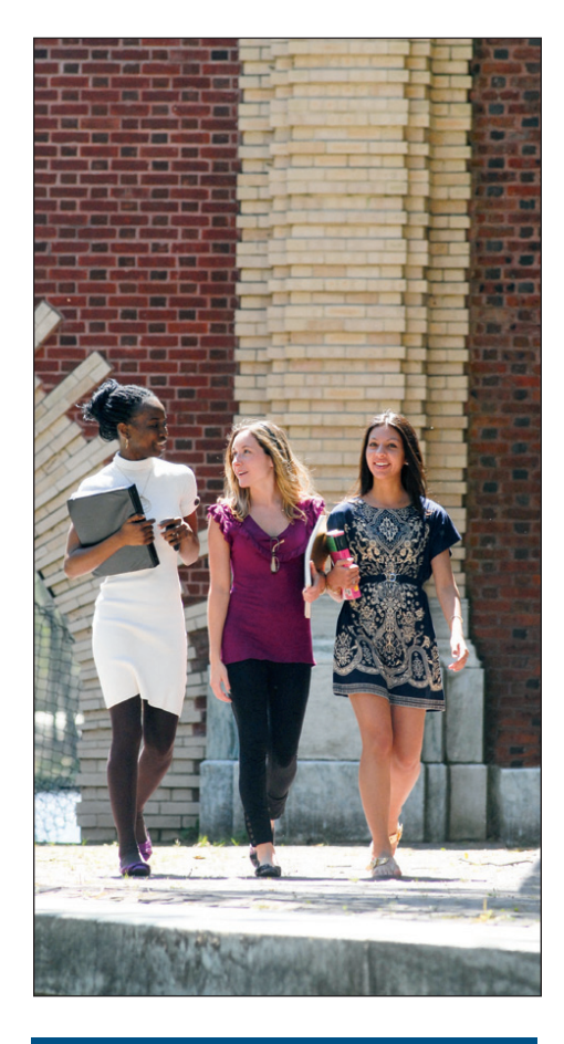
Georgian Court University is an equal opportunity employer.

The university's commitment to the environment and sustainability is