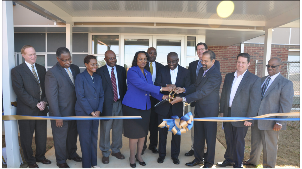
Fort Valley State University held the official ribbon cutting ceremony for the Family Development Center and Quality Child Care Center Complex on March 3, 2016, in Fort Valley.

Approximately 90 minutes south of Atlanta on I-75, the city is only three hours west of the Atlantic coastline. The Hartsfield-Jackson Atlanta International Airport is an hour and a half away.