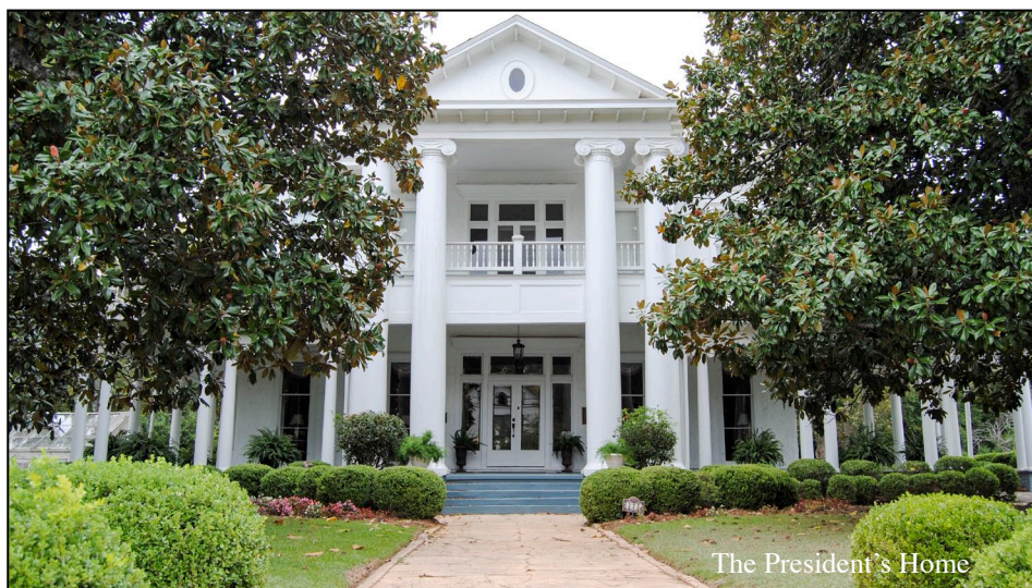
The President's Home

The town is the crossroads of two major state highways that provide easy access to large city offerings. Located 60 miles north is Columbus, Georgia, which is known for its water activities, cultural arts, and shopping and dining venues. Tallahassee, Florida, and beautiful white sand beaches are only two hours south.